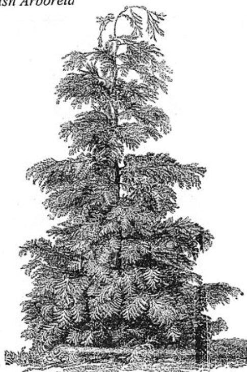
A Noble Lawn Tree (Cupressus Lawsoniana).